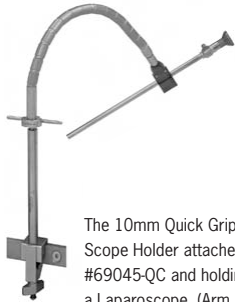
The 10mm Quick Grip Scope Holder attached to #69045-QC and holding a Laparoscope. (Arm and scope sold separately)

Safely and quickly secures 5mm and 10mm endoscopes. Atraumatic Delrin Jaws will not damage scopes. Can also be used to hold laparoscopic instruments.