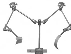
Two Bookler Ratchet Bar Attachments inserted in #73010, holding Bookler retractor blades. (Arm and blades sold separately)

A list of available Bookler Retractor Blades can be seen in the MEDIFLEX Table Mounted Retractor Catalog RET-0709.