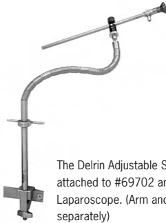
The Delrin Adjustable Scope Holder attached to #69702 and holding a Laparoscope. (Arm and scope sold separately)

These tips are adjustable and can hold instruments and endoscopes having diameters ranging from 1.5mm to 12.5mm