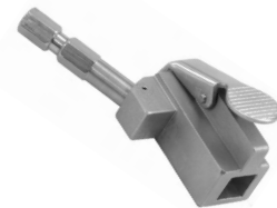
■ REF. NO. 69708 Bookler Ratchet Bar Attachment

Ideal for use in Open Surgery or in Laparoscopic procedures that convert, this device allows any Bookler or Bookwalter-style retractor to be held in Mediflex Arms.