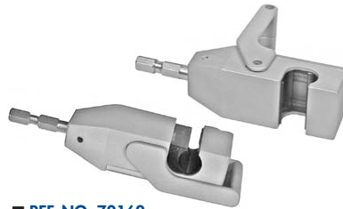
■ REF. NO. 72162 10mm Quick Grip Scope Holder