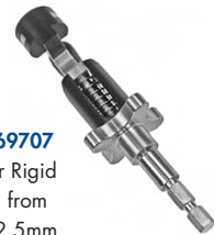
■ REF. NO. 69707 Delrin Tip for Rigid Endoscopes, from 1.5mm to 12.5mm.