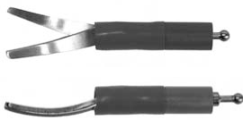
■ REF. NO. 91710-10 Curved 3/4" (1.9cm) Metzenbaum Scissor Tips, Box of 10, Sterile

The Cutting Edge Product Line from Mediflex is a Laparoscopic System consisting of Reusable Laparoscopic Instrument Handles and Disposable Scissor and Dissector tips. It provides the economy of a reusable handle with the guarantee of a new tip for each procedure. Photos below show 2 views of each tip: opened, closed from above and closed from the side.