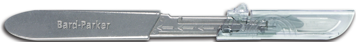
Protected Surgical Blades and Reusable Handles